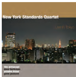
Live In Tokyo 2008